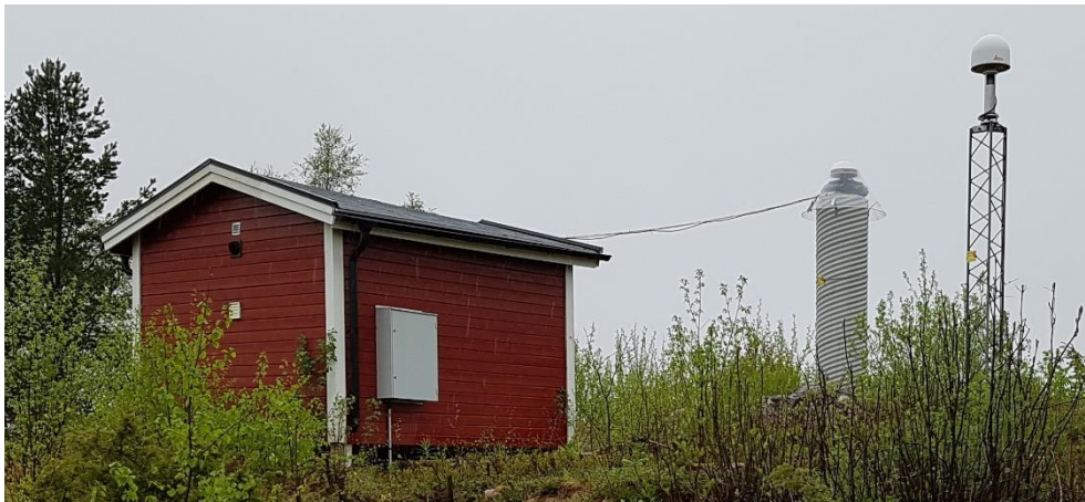
Figure 1.3: Sveg is a SWEPOS class A station. It has both a new monument (established in 2011) and an old monument (from 1993).

By the time for the 18th NKG General Assembly in September 2018 SWEPOS consisted of totally 401 stations (41 class A stations and 360 class B ones), see Figures 1.3 and 1.4.