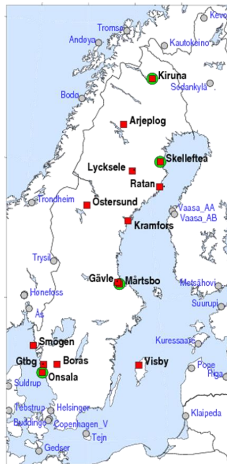
Figure 1.7: There are 14 absolute gravity sites (for FG5/FG5X) in Sweden marked with red squares in the map. Absolute gravity sites in neighbouring countries are marked with grey circles. The four sites with time series more than 15 years long have a green circle as background to the red square.

In the beginning of 2018, the new Swedish gravity reference frame RG 2000 became official (Engfeldt et al., 2018). The reference level is as obtained by absolute gravity observations according to international standards and conventions. It is a zero-permanent tide system in post-glacial rebound epoch 2000. RG 2000 is realised by the