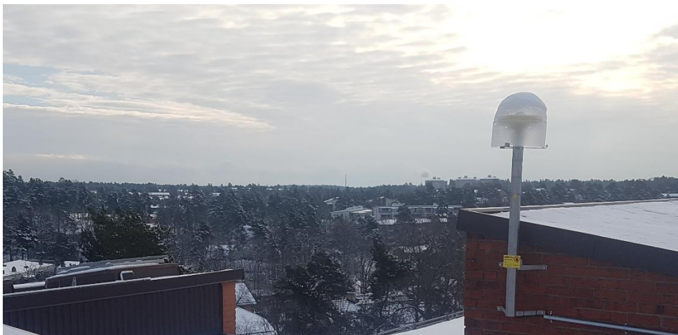
Figure 1.4: Gustavsberg is a SWEPOS class B station with a roof-mounted GNSS antenna mainly established for network RTK purposes.

This means that the total number of SWEPOS stations has increased with 96 stations since the previous NKG General Assembly, see Figure 1.5.