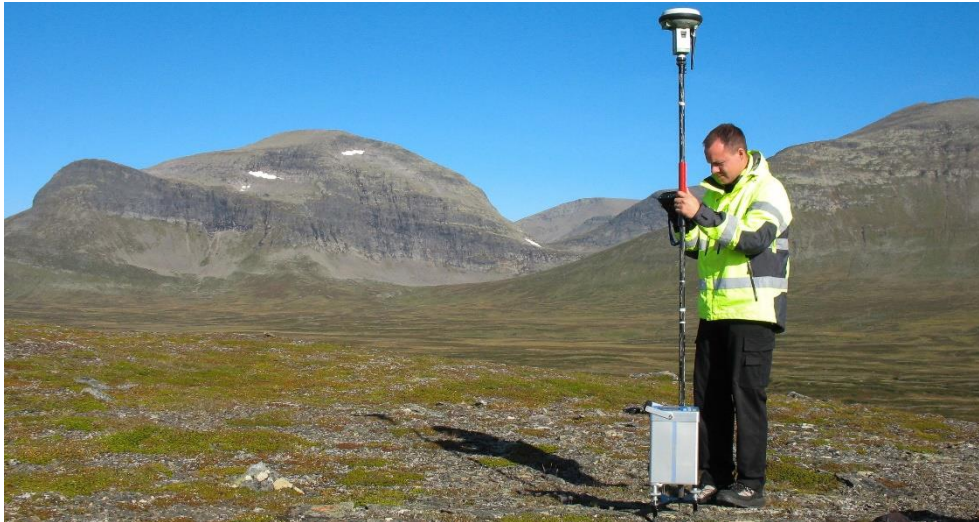
Figure 1.6: More than 3,400 new relative gravity measurements have been performed in Sweden since 2010. The heights of the locations are determined by network RTK measurements.

The work with NKG2015 was performed in the geoid model project of the NKG Working Group of Geoid and Height Systems. An update of the NKG gravity database for the whole Nordic-Baltic area and a creation of a new NKG GNSS/levelling database and a common DEM were also included in the project. Independent computations for NKG2015 were first made by five computation centres – from Sweden, Denmark, Finland, Norway and Estonia – using different regional geoid computation methods, software and set-ups. The modelling method utilised for the final model, the Least Squares Modification of Stokes' formula with additive corrections, was chosen based mainly on the agreement to GNSS/levelling. GNSS/levelling evaluations show that NKG2015 is a significant step forward, not only compared to previous NKG geoid models, but also with respect to other state-of-the-art ones covering the whole Nordic-Baltic area, e.g. EGM2008, EGG2015 and EIGEN-6C4.