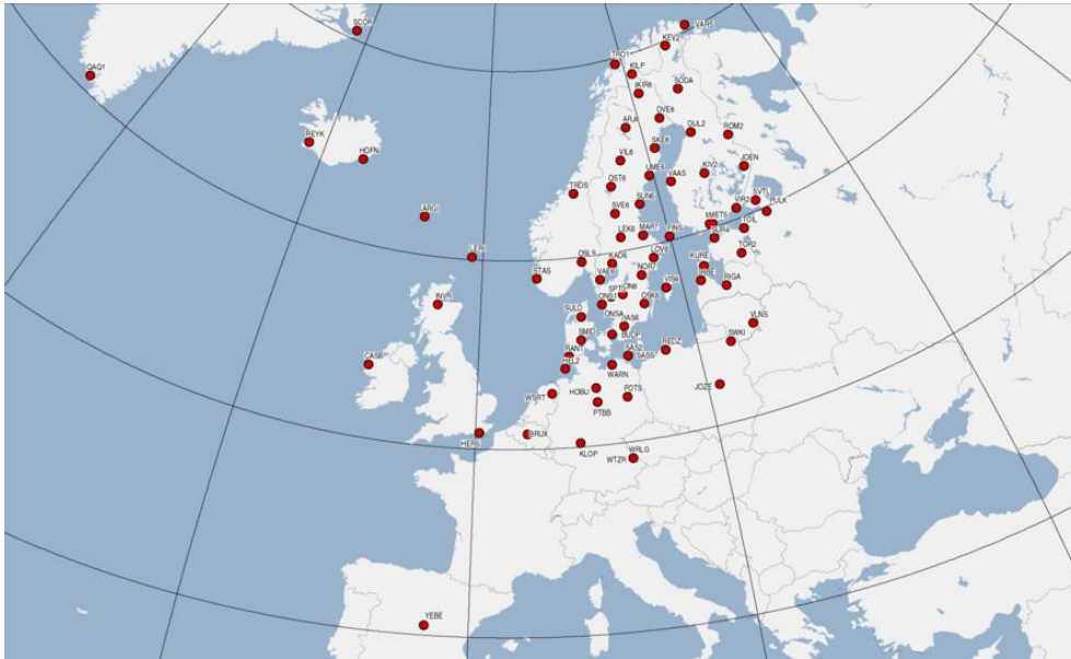
Figure 1.1: The NKG EPN AC sub-network of 88 permanent reference stations for GNSS.

The NKG GNSS analysis centre project was declared fully operational in April 2017 and it is chaired by Lantmäteriet (Lahtinen et al., 2018). The project aims at a dense and consistent velocity field in the Nordic and Baltic area. Consistent and combined solutions are produced based on national processing following the EPN analysis guidelines. A reprocessing of the full NKG network of reference stations including all Nordic and Baltic countries for the years 1997–2016 has been completed and the time series analysis has been finalised during 2018.