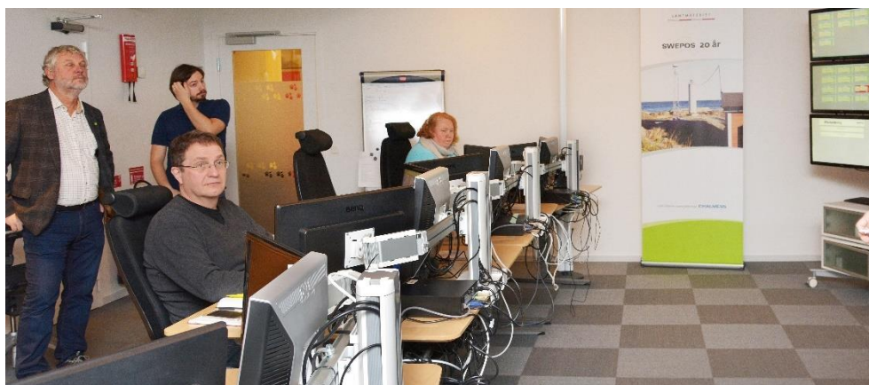
Figure 1.2: The SWEPOS control centre at the headquarters of Lantmäteriet in Gävle during a study visit in 2016 by Mr Peter Eriksson, the Swedish Minister for Housing and Digital Development.

SWEPOS™ is the Swedish national network of permanent GNSS stations operated by Lantmäteriet, see Figure 1.2 (Lilje et al., 2014). The SWEPOS website is available on www.swepos.se ( www.lantmateriet.se/swepos ).