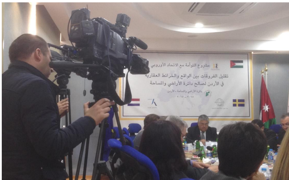
Figure 1.10: The mission in the EU Twinning project in Jordan was to enhance the technical and administrative capacities of the Department of Lands and Survey with the main purpose to reduce the discrepancies between the physical reality and the graphical cadastral information.