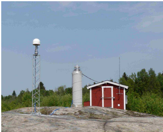
Figure 2: The SWEPOS station Hässleholm with the new and the old monument.

During 2011, new additional monuments have been established at the 20 original class A stations, see Figure 2. Several different designs were evaluated before finally choosing steel grid masts (Lehner, 2011). The new monuments are equipped with individual calibrated antennas and radomes of the type LEIAR25.R3 LEIT. Local surveys will be performed at the 20 stations during 2012.