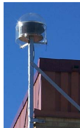
Figure 5: The simplified SWEPOS station Västerås

Data is collected from all stations every second and a 5 degrees elevation mask is used.