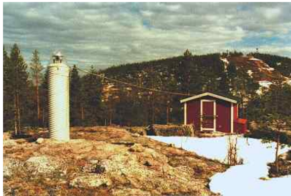
Figure 3: The SWEPOS station Överkalix