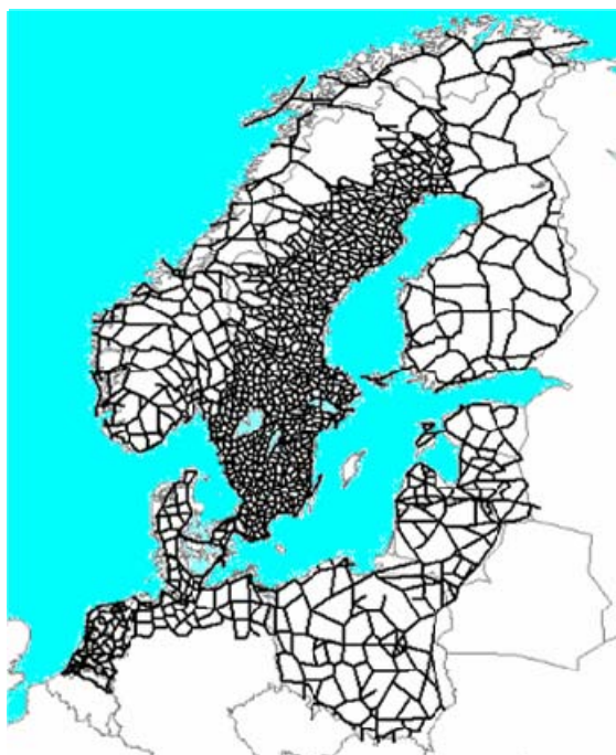
Figure 3: Nordic Height Block

The final computation has used a land uplift model based on a combination and modification of models developed by Olav Vestøl (Statens Kartverk, Norway) and Kurt Lambeck (Ågren et al. 2005).